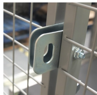
Hasp and staple lock (padlock to be supplied by others).

NOTE : Some panels may require cutting and modifying on site by others.